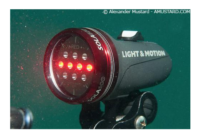
The red light mode of the SOLA600 focus light, produces a narrow spectrum of red light, making the light less visible to marine life, but well suited to help our cameras focus.

Perhaps the most exciting feature of the SOLA600 is the red light mode. It is often quoted that using a red light for focusing is beneficial because many species of marine life cannot see it. So you don't scare your subject in the process of focusing on it. The SOLA really works in this regard, but using it also really taught me that not all red lights are created. I have often added red filters to my diving lights, but have failed to notice any real advantage. This is because many red filters, while turning the light red, let through other colours too, which marine life can see. The SOLA600's red LEDs produce a very narrow spectrum of red light. You can see the difference by shining it on the cover of a magazine, a poorly filtered light will allow you to differentiate far more colours then the very pure red LEDs. The less colours you can see, the more effective the light.