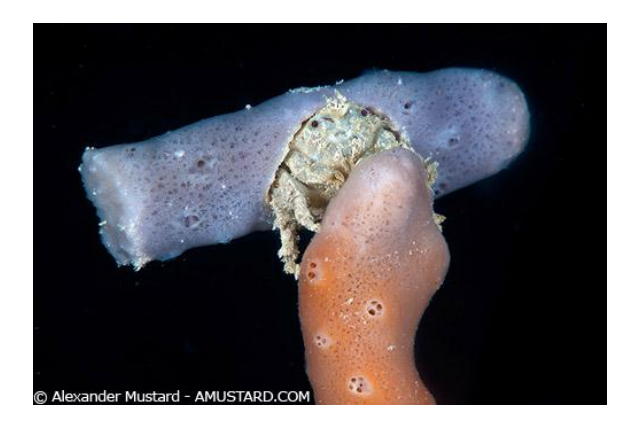
A good quality of focus light makes photography at night a much more pleasant and efficient process. Taken with a Nikon D700 + 105mm VR + 1.4x TC + 5T dioptre. Subal housing. Twin Subtronic strobes and SOLA600 focus light in red mode.

I have a couple of reliability concerns in the design, which are worth commenting on. I should restate, I have had no problems during my tests, but I feel I should mention them as areas to watch. I feel that there is a potential for the magnetic gliding switch to get clogged by sand or salt if not washed out regularly, particularly in a black sand location, like Lembeh. Light and Motion tell me that it has been designed with a wide tolerance to aid flushing of any debris. I found it could get a bit sticky if not washed well. I also feel there is a potential problem with wear on the exposed charging contacts, if a lazy user regularly didn't wash and dry away salt water before charging. Again, on my test unit, they still look like new. Given the price most of us will be expecting a long life of active service. Nothing I saw made me doubt that the SOLA600 will oblige in this respect.