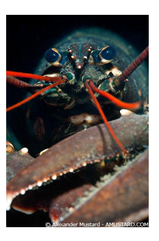
The red light mode was particularly useful for invertebrates, which, in general, seem less able to see red light than fishes. This clawed lobster photographed at night in Holland. Taken with a Nikon D700 + 105mm VR + 500D dioptre. Subal housing. Single Inon strobe with snoot and SOLA600 focus light in red mode.

The SOLA600 is the first red light that I have used that you can clearly see works in not spooking many marine species. I found the red light was most effective on invertebrates: molluscs, crustaceans, coral polyps, echinoderms etc. Another benefit is that this includes worms and other plankton that enjoy swarming around our dive lights at night these are definitely reduced by the red mode. However, many shallow water fish are clearly able to see red light, but when asleep (on night dives) it didn't wake them. It is also worth noting that while the light may be hard for critters to see, they will still detect an ungainly approach. It is not a licence to race or trash around. All of the photographers who tried this also commented positively on this aspect. In the Netherlands, one shooter even told me that they thought it even seemed to attract lobsters to the camera. Perhaps the lobsters were confused about the meaning of a red light in Holland?